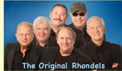
The Original Rhondels