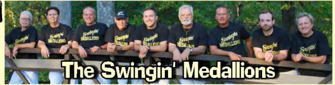
The Swingin' Medallions

12 pm TO 5:30 PM, Main Street OD September 18, 2023